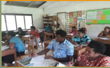
Cicia Primary School Teachers at the FNSC Presentations