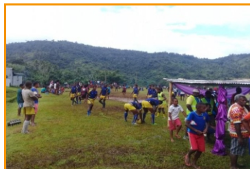
Newborn Rugby 7's Action in Wainimala Naitasiri.