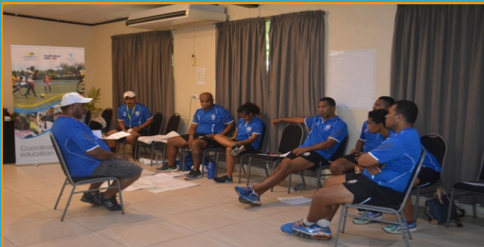
Strength and Conditioning Coaches in Nadi