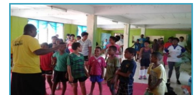
National Rugby League Takes the Sport to Primary Schools