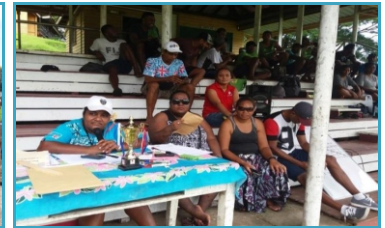
Red Cross Volleyball Tournament Action.