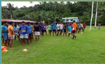
Action from Cicia Programs

279 primary school children were beneficiaries of the Basketball, Tag Rugby, Kids Athletics and Cricket programs conducted by the commission. Cicia High School Teachers were up-skilled in athletics disciplines to help them with their preparations for Coca Cola Games, 2018.