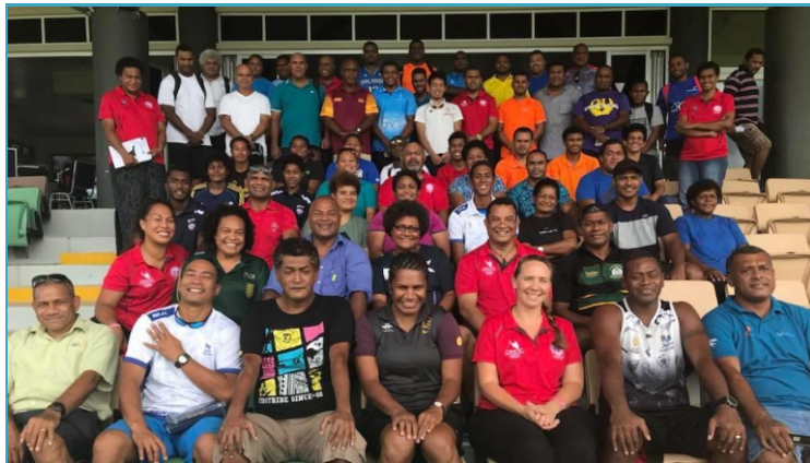
Participants from the First Fiji Coaches Forum held at Albert Park, Suva Fiji on 8th - 9th March, 2018. Fiji Sports Commission was proud to have supported this initiative with ONOC through their OSEP program and FASANOC

The first ever Fiji Sports Coaches Forum took place at the Albert Park Complex in Suva thanks to the initiative of the Fiji National Sports Commission, Oceania National Olympic Committee and Fiji Association of Sports and National Olympic Committee (FASANOC). Over 70 coaches at all levels of coaching converged at the Albert Park Complex to rub shoulders and share their experiences, the challenges they face and how they could contribute to raising the profile of sport in the country.