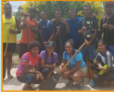
Paddling Community Coaches at the Program