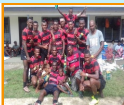
Ra Provincial Youth Sports Pictures