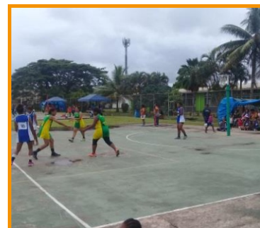
Action from Southern Division Youth Sports Tournament 15 and 16 December, 2017