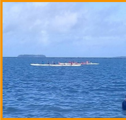
Paddling coaches take to the water