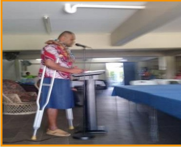
Assistant Minister of Sports Opening Central Urban Train the Trainer Program