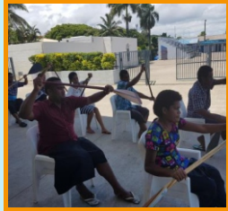
Learning the basics of paddling