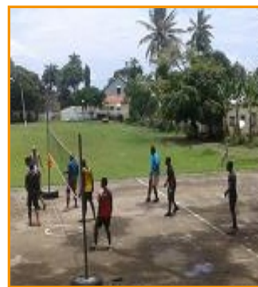
Action from Weekly Volleyball League – Levuka